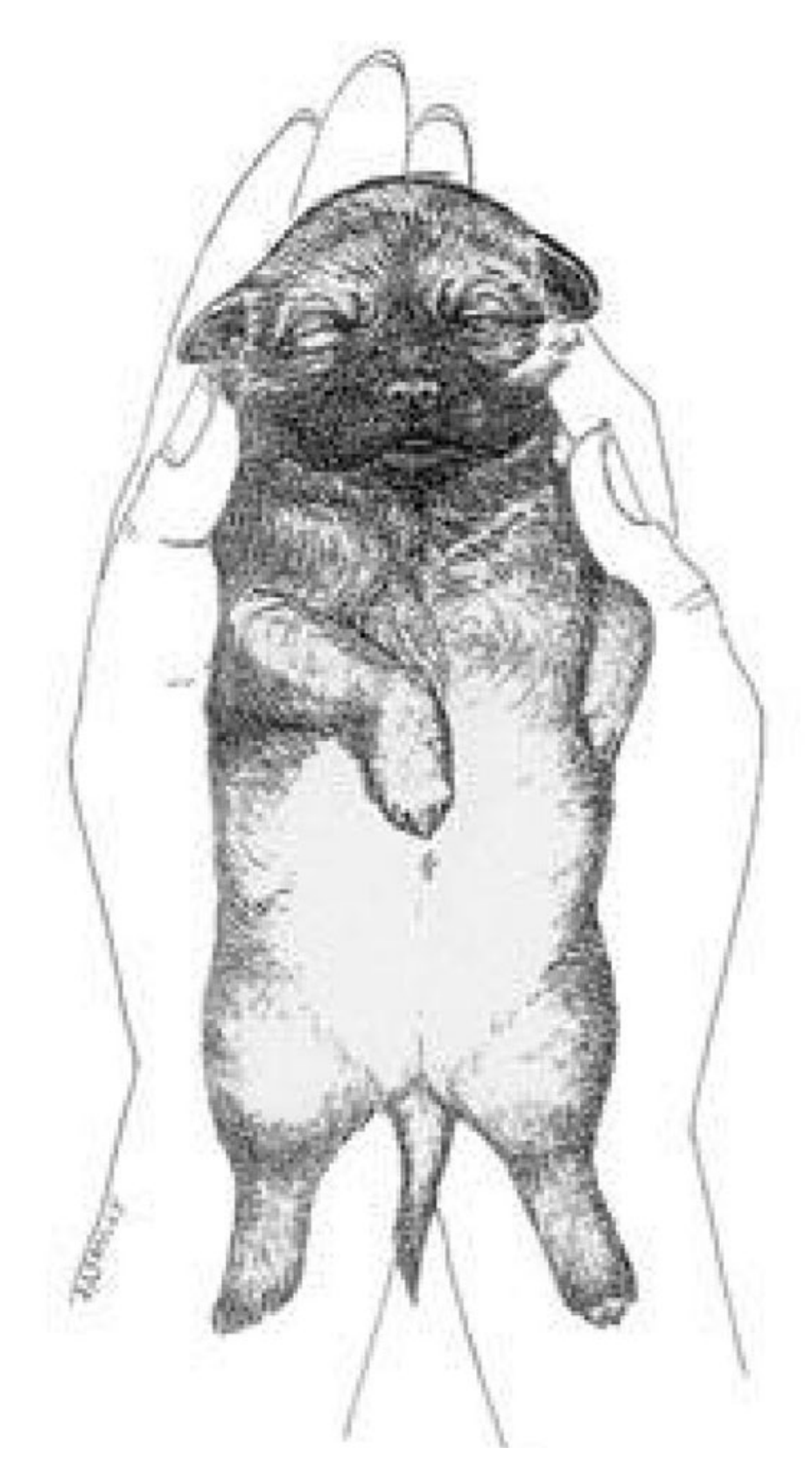
Figure 5 Thermal stimulation