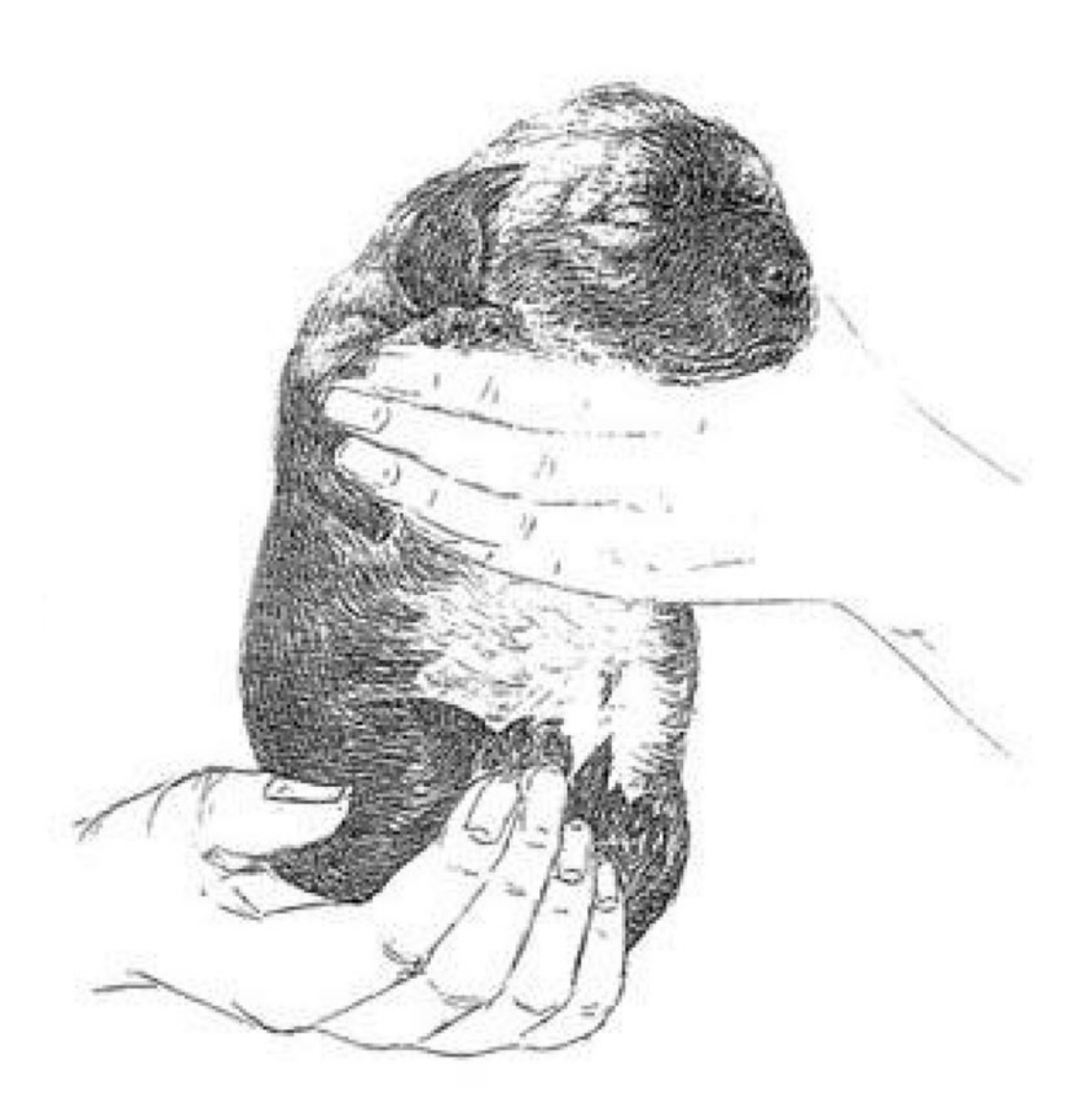
Figure 3 Head pointed down